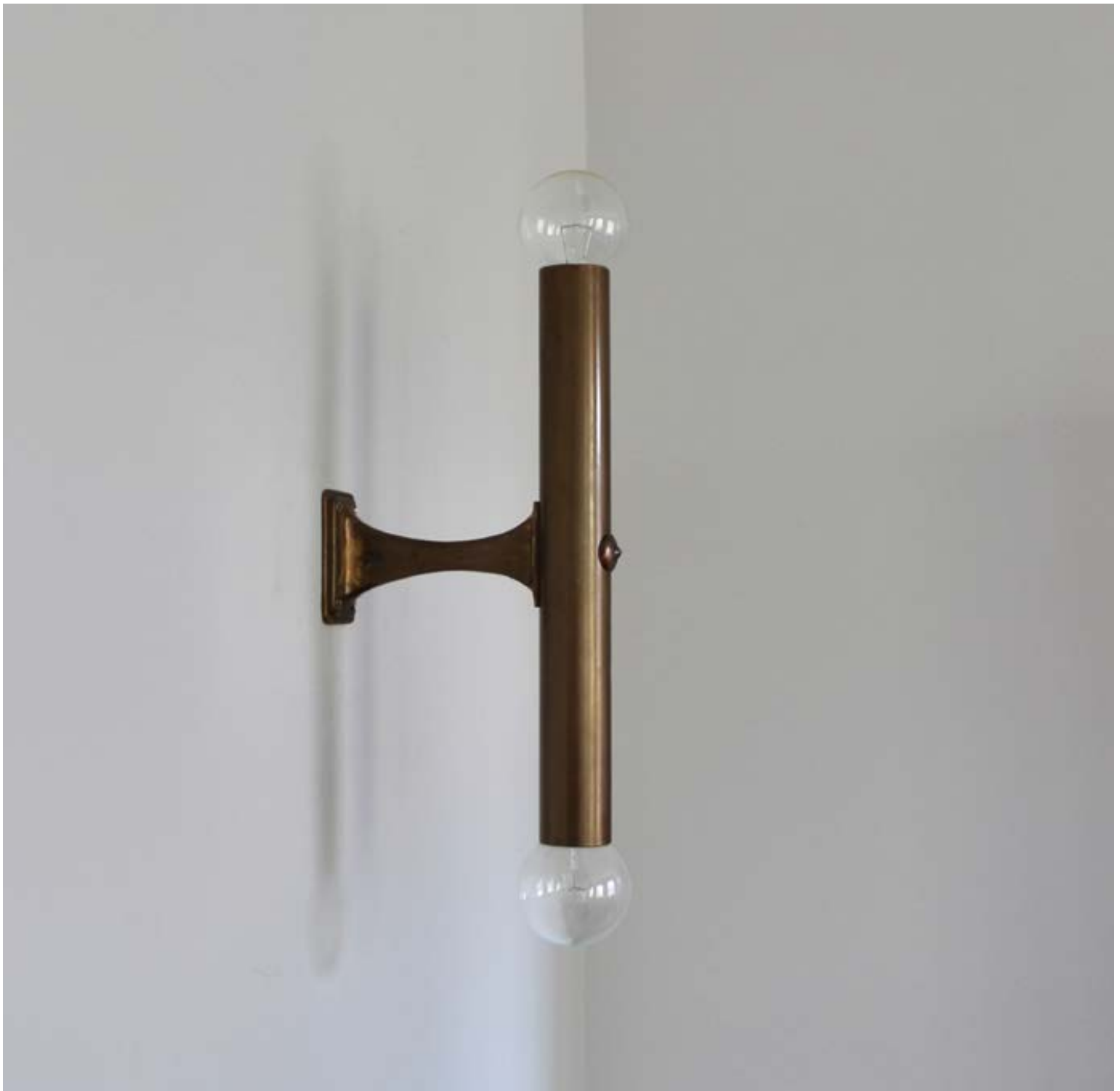
The vesper wall light in brass | chocolate